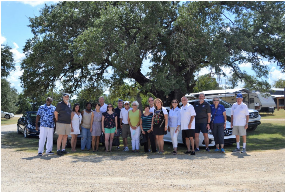
The group and their cars.

After lunch, we made our way to the Sledge Distillery in Tolar for whiskey and moonshine tasting. This was an optional activity but everyone attended. This tiny distillery creates whiskey and moonshine from the original recipes found in the war chest of the owner's father, who made moonshine for his fellow soldiers while stationed in the South Pacific during the Second World War.