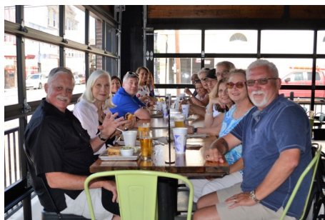
At Miller's BBQ.