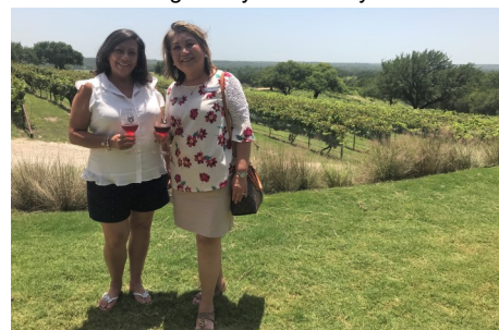
The vineyard is a beautiful venue.