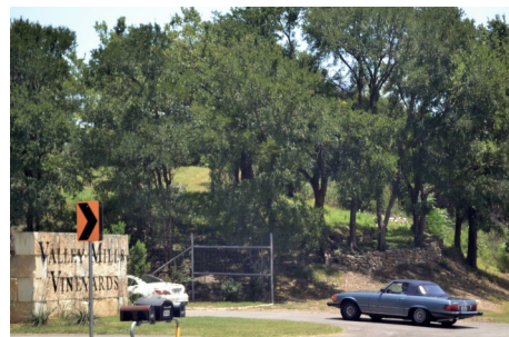
Arriving Valley Mills Vineyards.