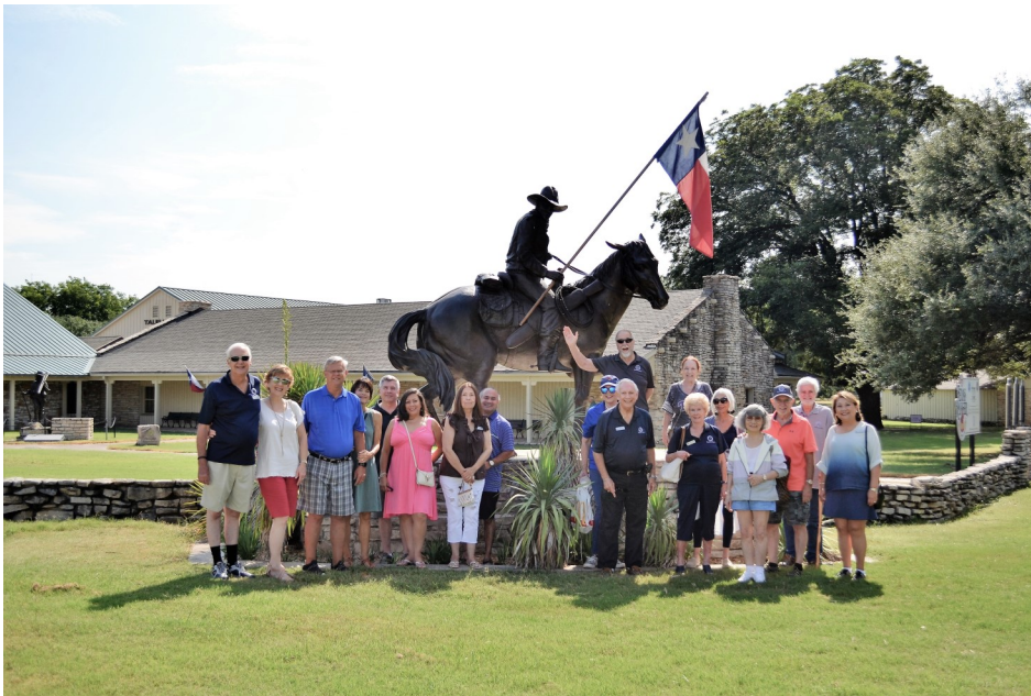
The iconic Texas Ranger statue and its Lone Star flag near the museum's entrance