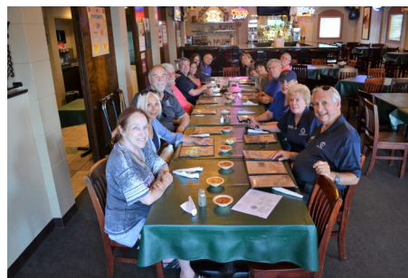
At the El Conquistador Mexican Restaurant.