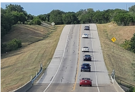
En route to Waco.