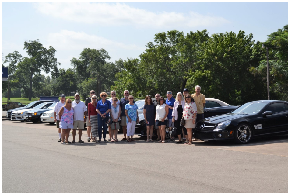
The group and their cars

After some socializing with a glass (or so) of wine, we took to our cars for the long drive home.