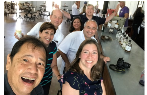
At Sledge Distillery. Such a happy group.