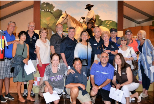
The group inside the museum.

After our museum visit, we lunched at the original El Conquistador Mexican restaurant, a family-owned establishment which has served hungry Wacoans since the sixties. After lunch, we made our way home on our own.