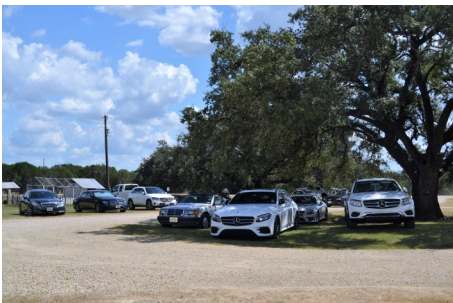
Found some shade at the distillery.