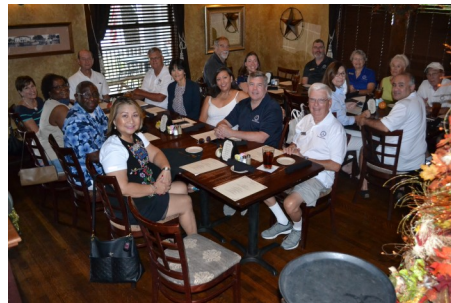
Cozy seating at the grill.