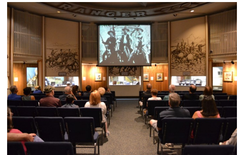
History Channel presentation of the service's history.