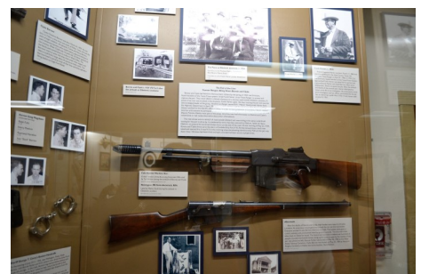
Bonnie & Clyde exhibit.