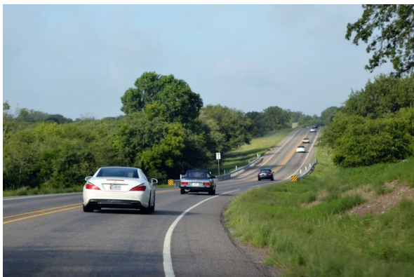
The caravan en route to Belton.

Twenty-two folks in 13 cars joined us for a Texas BBQ and wine tour. From Fort Worth, we drove to Belton on scenic roads less traveled. Our first destination was Miller's Smokehouse for lunch. Texas Monthly says this is one of the best BBQ joints in the world (but surely they meant Texas?), and Miller's Smokehouse did not disappoint.