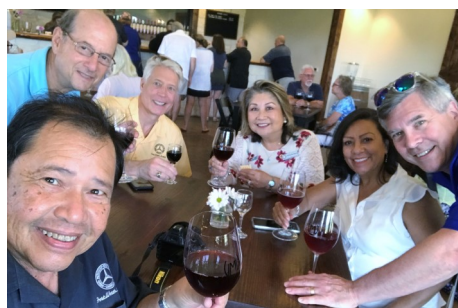
Wine and friends.