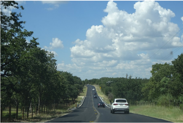
We enjoyed driving on this wonderful country road.

Nineteen folks in eleven cars joined us for a great drive, a fine lunch, and whiskey and moonshine-tasting.