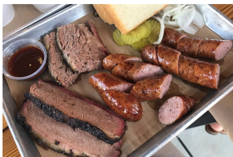
Hard to beat a Miller's BBQ meal.