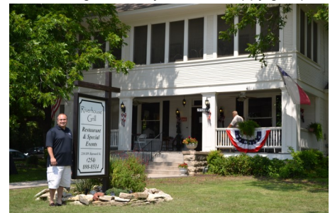
A historic home houses the Riverhouse Grill.