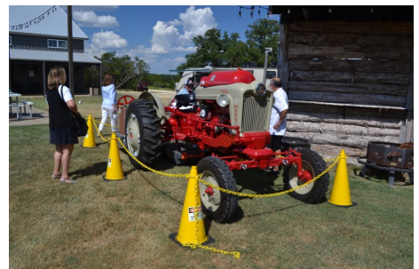
Ice cream maker - restored Ford tractor churns the cream.