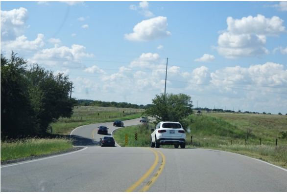
Yet another way to get to Glen Rose.