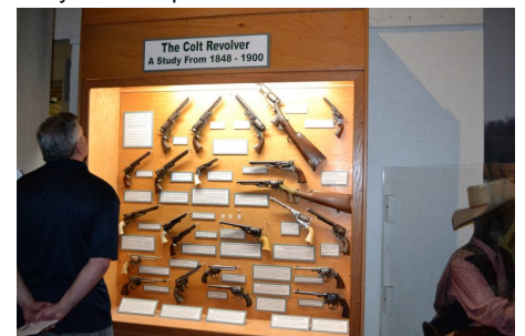
History of the Colt revolver.