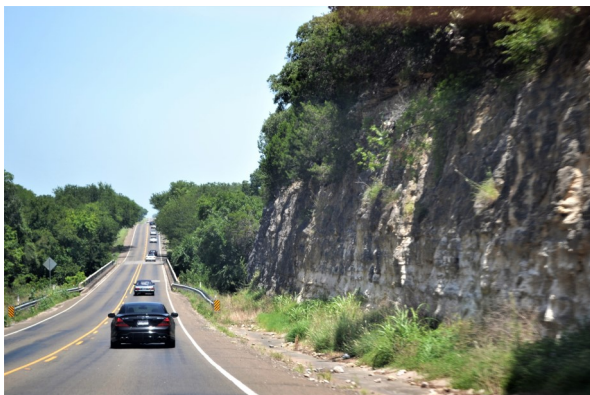
On our way to Valley Mills.

Twenty-two folks in 13 cars joined us for a Texas BBQ and wine tour. From Fort Worth, we drove to Belton on scenic roads less traveled. Our first destination was Miller's Smokehouse for lunch. Texas Monthly says this is one of the best BBQ joints in the world (but surely they meant Texas?), and Miller's Smokehouse did not disappoint.