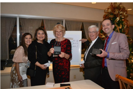
Team G - Benz Bowl Champs!