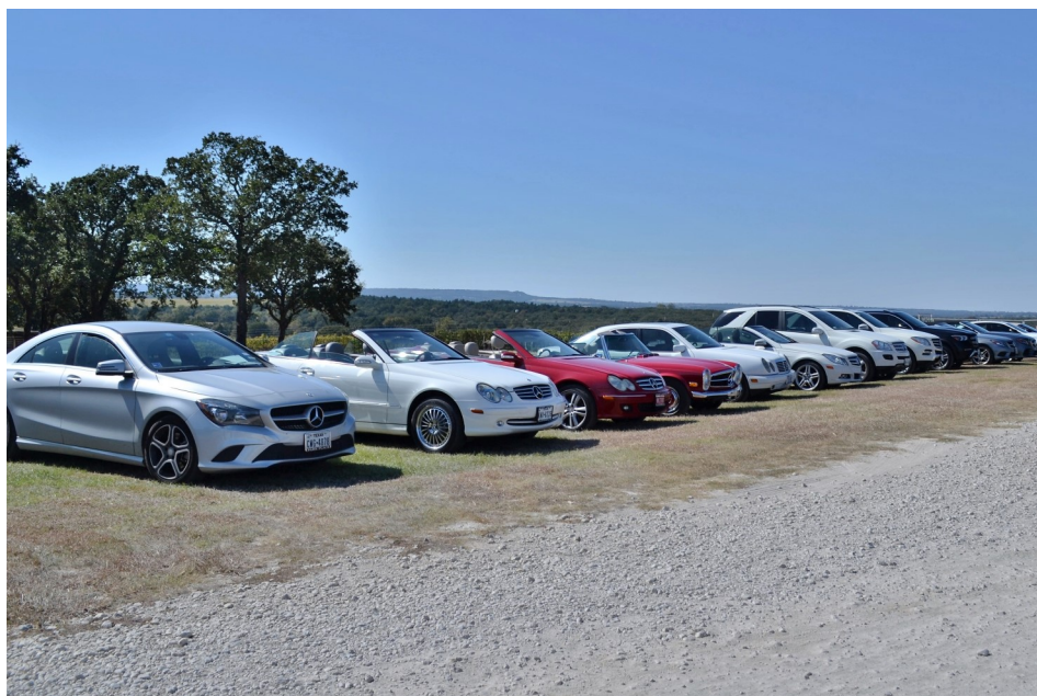
Special parking for us.

The event ended after the winery tour, but some members returned to Muenster to shop at Fischer's Meat Market for some German sausage, cheese and other goodies.