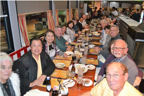
Group dinner at Bella Sera, Fredericksburg.

Thirty-six folks in 18 cars joined us for the 2019 Fall Overnighter in Fredericksburg, TX. The always-fun WW2 airbase-themed Hangar Hotel, which is just a short hop away from Fredericksburg's main drag, served as our headquarters.