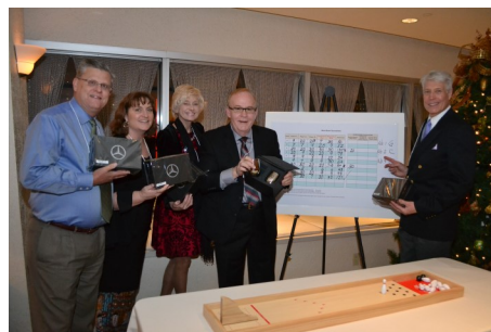
Team C - Second Place.