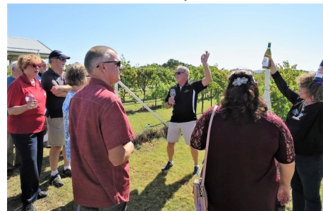
Kicking off the wine-tasting.