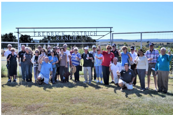
Group pic at the Blue Ostrich Winery in St. Jo.

Thirty-two folks in 17 cars joined us for a country drive, a German lunch at Rohmer's Restaurant in Muenster, and a wine-tasting and winery tour at Blue Ostrich Vineyard and Winery in St. Jo. At Rohmer's, most enjoyed German food like schnitzel and sausages while some had American home-cooked meals.