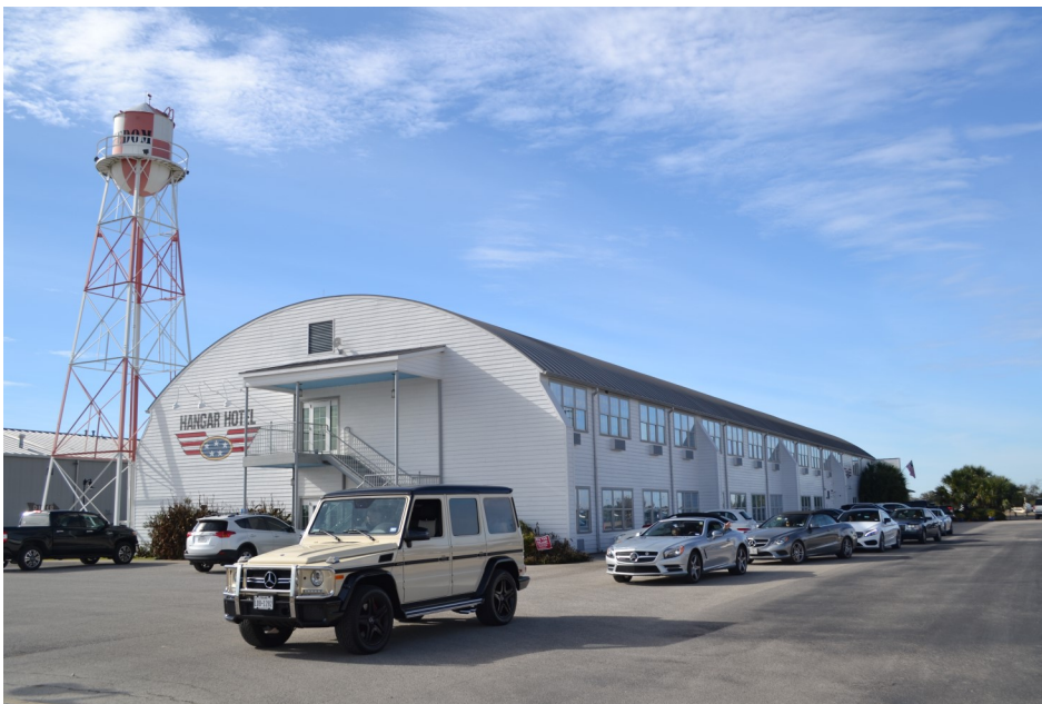
Ready to leave the Hangar Hotel, Fredericksburg.