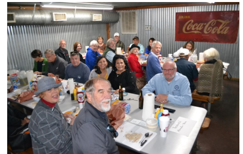
Lunch at Cooper's BBQ, Llano.