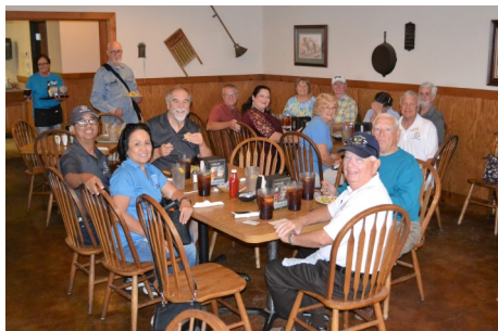
Enjoying schnitzel, sausage and other eats.