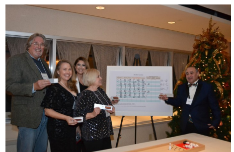
Team J - Third Place.