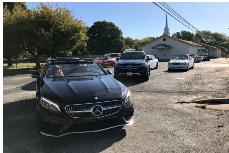
Waiting for the rest of the caravan.