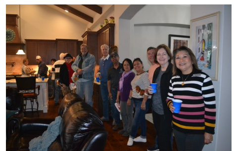
At the Pitzen Haus, Kingsland.