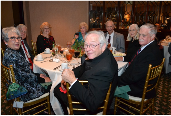
A great dinner with friends.