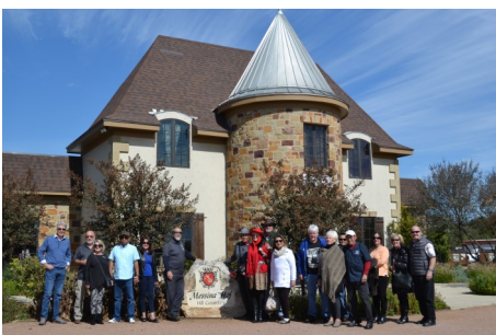
Messina Hof Winery, Fredericksburg.