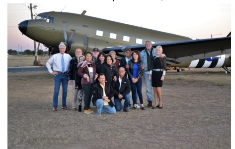
Part of the group with a WW2 C-47 Dakota.