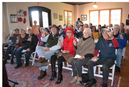
The group enjoying a wine-tasting.