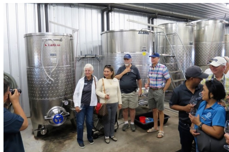
Touring the winery.