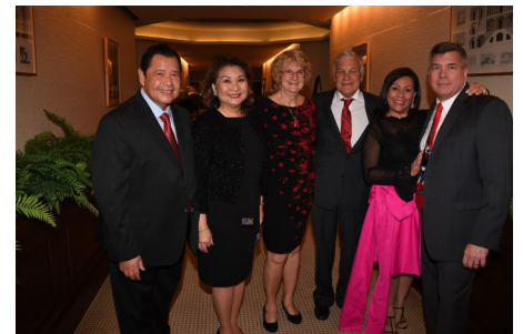
Officers arriving early to set up.