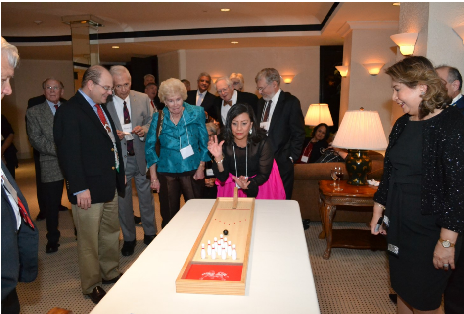
Benz Bowl - a chance to win great prizes