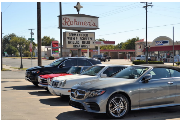
Lunch at Rohmer's in Muenster.

Thirty-two folks in 17 cars joined us for a country drive, a German lunch at Rohmer's Restaurant in Muenster, and a wine-tasting and winery tour at Blue Ostrich Vineyard and Winery in St. Jo. At Rohmer's, most enjoyed German food like schnitzel and sausages while some had American home-cooked meals.