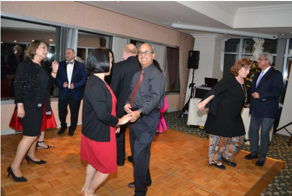
Dancing to cap a fun event.

Fifty-four members and guests attended the Fort Worth Section's 2019 Holiday Dinner-Dance, which was held at the City Club in the heart of Downtown Fort Worth. Arriving members were welcomed with an hors d'oeuvres reception, giving everyone a chance to catch up and get to know new folks.