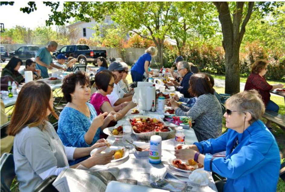
Gorgeous day for a crawfish boil.