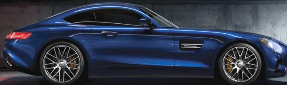
Image in context promotional materials doesn't necessarily represent actual prize being won.

Purchase your tickets today for a chance to win your dream car.