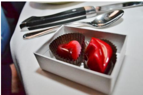
Chocolates for the ladies.

Twenty-five members enjoyed the club's Pre-Valentine Dinner at Bob's Steak & Chop House, one of Fort Worth's best places for fine dining. Bob's is located inside the beautiful Omni Hotel in the heart of Downtown Fort Worth.