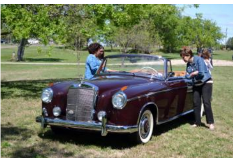
1960 220SE Cabriolet.