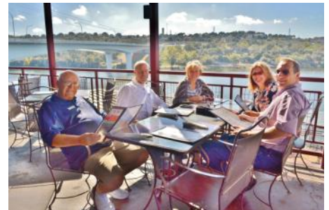
Lunch at Marble Falls.