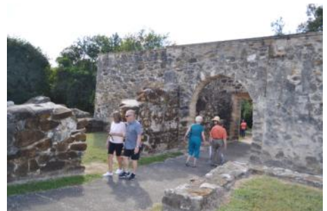
At Mission San Juan.