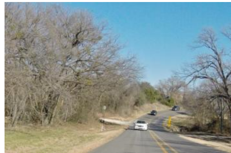
En route to Mingus.