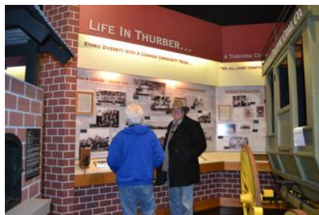
At the WK Gordon Museum.