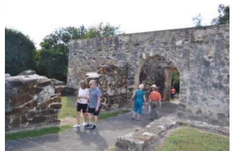
At Mission San Juan.