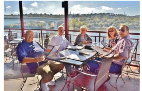
Lunch at Marble Falls.