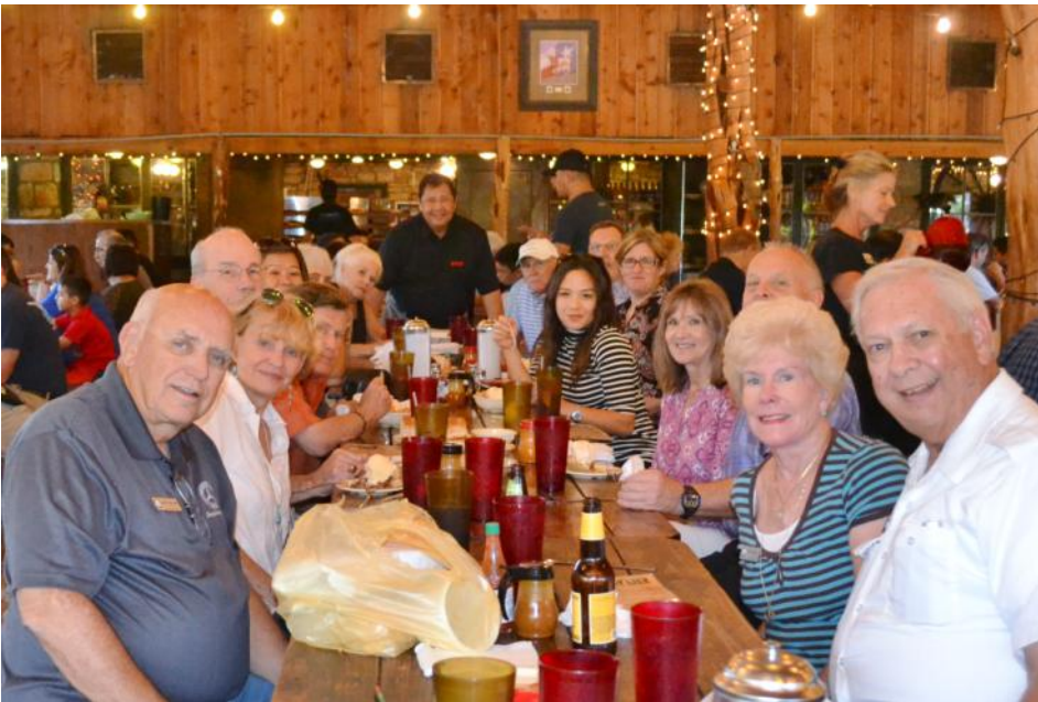
At Salt Lick BBQ in Driftwood.

On Sunday, we visited the last mission, The Alamo, on our own. It is preserved not as a Catholic mission, but as a shrine to Texas liberty. We then took to our cars at the designated time and place, and began our dippy, twisty Hill Country Drive. We stopped for a break at the quaint little town of Wimberley for some window shopping, then continued our drive. Lunch was at the famous Salt Lick Barbecue in Driftwood. After lunch, we continued our Hill Country road trip, our Mercedes cars at home on the twisties. We said our goodbyes at a Starbucks stop in Marble Falls then made our way home.