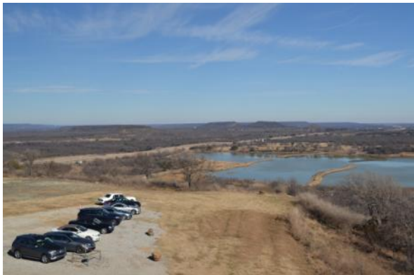
View from atop the castle.

Twenty-five members in fourteen cars attended our first event of the year, despite cold weather and snow the previous evening. We enjoyed a very nice drive on scenic, twisty and hilly roads.