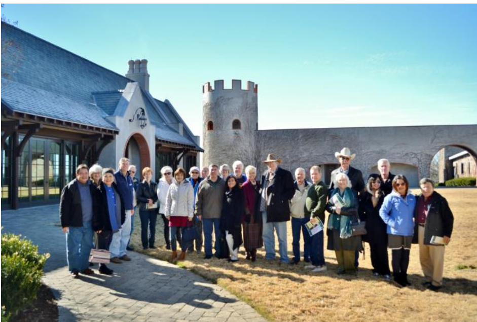
Group photo at the castle.

After lunch, we visited the W. K. Gordon Center's small but very interesting museum on the history of Thurber, which was an industrial town wholly owned by The Texas and Pacific Coal Company. Now a ghost town, Thurber was a major brick and coal center in its heyday, attracting a population of 10,000 from eighteen nationalities. After the museum visit, some of us went to a nearby park to see original Thurber buildings which are being preserved there.