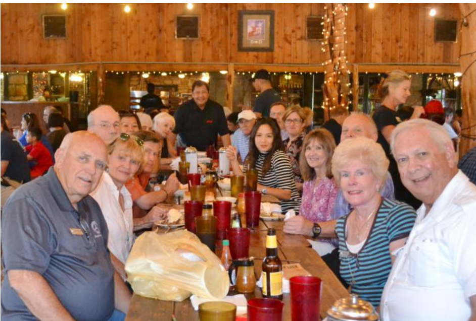
At Salt Lick BBQ in Driftwood.

On Sunday, we visited the last mission, The Alamo, on our own. It is preserved not as a Catholic mission, but as a shrine to Texas liberty. We then took to our cars at the designated time and place, and began our dippy, twisty Hill Country Drive. We stopped for a break at the quaint little town of Wimberley for some window shopping, then continued our drive. Lunch was at the famous Salt Lick Barbecue in Driftwood. After lunch, we continued our Hill Country road trip, our Mercedes cars at home on the twisties. We said our goodbyes at a Starbucks stop in Marble Falls then made our way home.