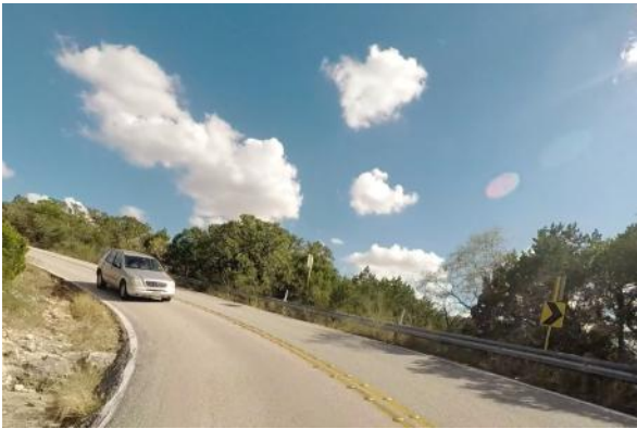
Hill Country drive.

On Saturday, we began our trip from Fort Worth to San Antonio. We stopped for lunch with a lakeside view at the River City Grill in Marble Falls on our way south. Arriving San Antonio, our first stop was Mission Espada, which is the southernmost mission. After the Espada stop, we visited the still-functioning Espada Aqueduct, built in the 1750s, which helped supply water to farms and ranches that sustained the Indians who chose Spanish protection in exchange for labor, conversion to Christianity and a different way of life. We worked our way north, visiting Missions San Juan, San Jose and Concepcion, each stark and beautiful in its own way, but each a common remnant of Spain's efforts to extend its Empire and Christianity.