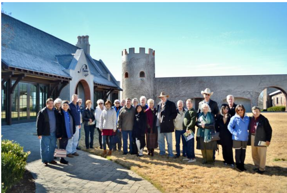
Group photo at the castle.

After lunch, we visited the W. K. Gordon Center's small but very interesting museum on the history of Thurber, which was an industrial town wholly owned by The Texas and Pacific Coal Company. Now a ghost town, Thurber was a major brick and coal center in its heyday, attracting a population of 10,000 from eighteen nationalities. After the museum visit, some of us went to a nearby park to see original Thurber buildings which are being preserved there.