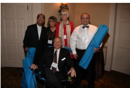
Team E with their loot.