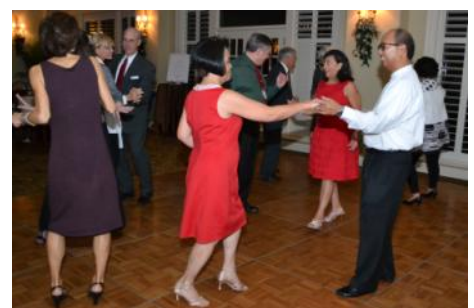
Time to dance.