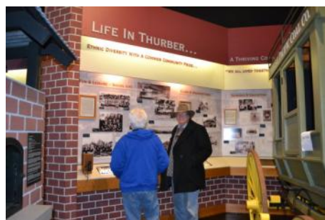
At the WK Gordon Museum.