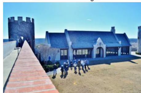
Some of us went up to the walls and turrets.