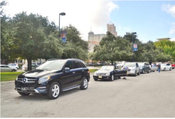
Getting the caravan ready.

Sixteen members in 8 cars toured the chain of missions established along the San Antonio River in the 18th century. These missions are a reminder of Spain's attempts to extend its influence north of New Spain (now Mexico).