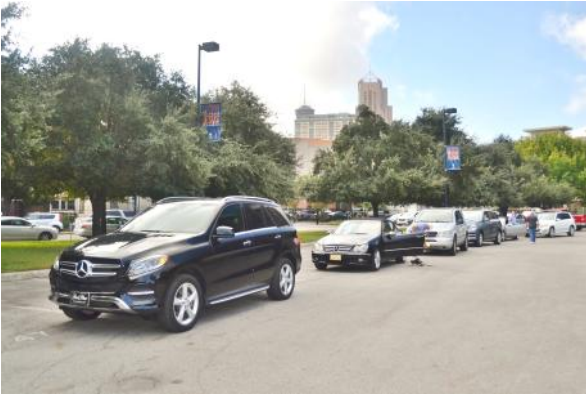
Getting the caravan ready.

Sixteen members in 8 cars toured the chain of missions established along the San Antonio River in the 18th century. These missions are a reminder of Spain's attempts to extend its influence north of New Spain (now Mexico).