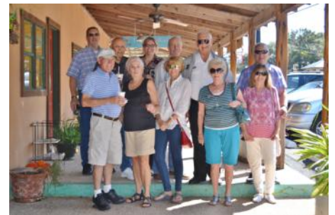
Stop at Wimberley.