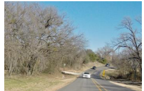
En route to Mingus.