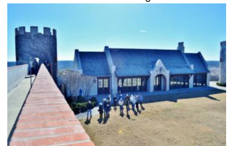
Some of us went up to the walls and turrets.