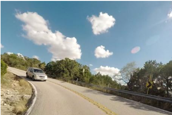
Hill Country drive.

On Saturday, we began our trip from Fort Worth to San Antonio. We stopped for lunch with a lakeside view at the River City Grill in Marble Falls on our way south. Arriving San Antonio, our first stop was Mission Espada, which is the southernmost mission. After the Espada stop, we visited the still-functioning Espada Aqueduct, built in the 1750s, which helped supply water to farms and ranches that sustained the Indians who chose Spanish protection in exchange for labor, conversion to Christianity and a different way of life. We worked our way north, visiting Missions San Juan, San Jose and Concepcion, each stark and beautiful in its own way, but each a common remnant of Spain's efforts to extend its Empire and Christianity.