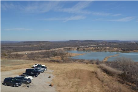
View from atop the castle.

Twenty-five members in fourteen cars attended our first event of the year, despite cold weather and snow the previous evening. We enjoyed a very nice drive on scenic, twisty and hilly roads.