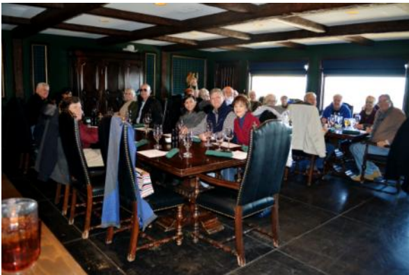
Lunch in the main dining room.

The Greystone Castle is a unique structure, turrets and all, located on 6500 acres of ranchland and hunting grounds. It sits on a hill and offers a majestic view of the surrounding area. Many of us climbed the stairs to the turrets and walls and enjoyed the scenery below. We had a delicious lunch at the castle's main dining room, which we had all to ourselves.