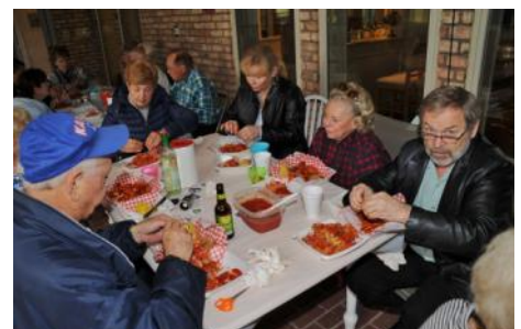
So spicy - but it hurts so good.