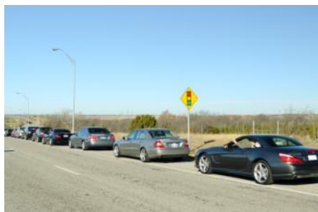
Ready to go.