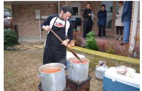
Our cook at his craft.