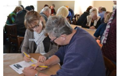
Our members take these games seriously.