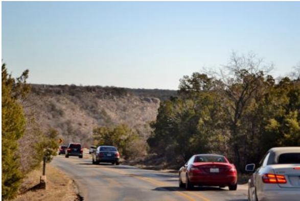
Not all of Texas is flat.

After weeks of dreary weather, abundant sunshine and warm temperatures graced our first event of the year. Thirty-nine members in 22 cars joined us for a nice country drive to Graford, a great lunch and a fun chance to win some prizes. Our destination was the Chaparral Grill at the Cliffs Resort, where we enjoyed a Texas-themed lunch buffet and a view of Possum Kingdom Lake.