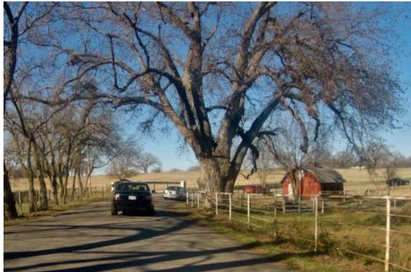
En route to Graford.

After lunch, we played our very own Mercedes-Benz crossword puzzle “couples” game. The 5 couples with the highest scores chose their prizes from a pool of Mercedes-Benz boutique items.