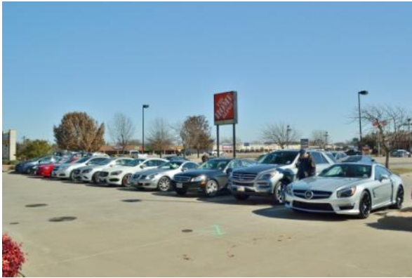
Stopping to pick up more cars at Granbury.

On a perfect Saturday with 70+ degree weather under gorgeous sunny skies, 32 members in 16 cars enjoyed a nice country drive, a great lunch, and some Valentine chocolate shopping. Those who brought convertibles put their tops down to take full advantage of this splendid day.