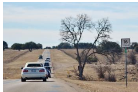
Roads were dry. Good driving conditions.