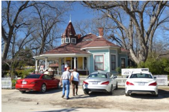
The Wiseman House chocolate store.

On a perfect Saturday with 70+ degree weather under gorgeous sunny skies, 32 members in 16 cars enjoyed a nice country drive, a great lunch, and some Valentine chocolate shopping. Those who brought convertibles put their tops down to take full advantage of this splendid day.