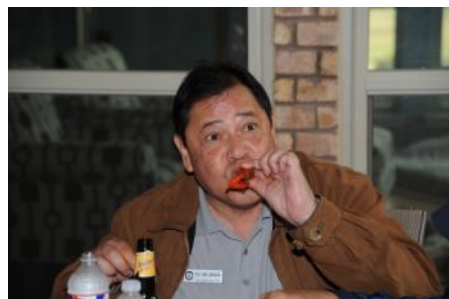
Suck dem heads!.