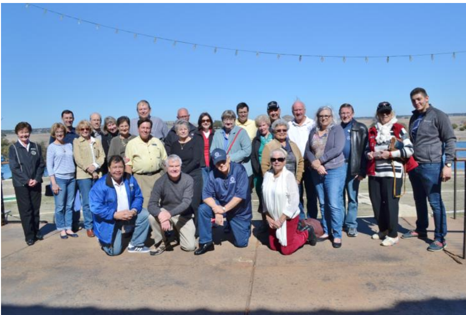
Group photo on the patio.

After lunch, we took to our cars for the drive to Hico, where we shopped for Valentine chocolates at the Wiseman House Chocolate Store. After shopping was done, we returned home on our own.