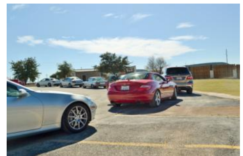
Getting set to leave for Hico.