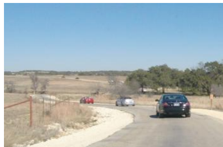
On the private ranch road.