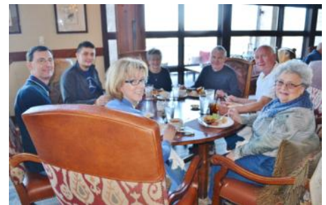
Enjoying lunch in the rustic dining room.