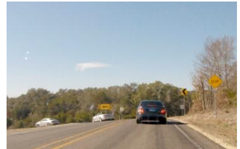
Caravan en route to Glen Rose.