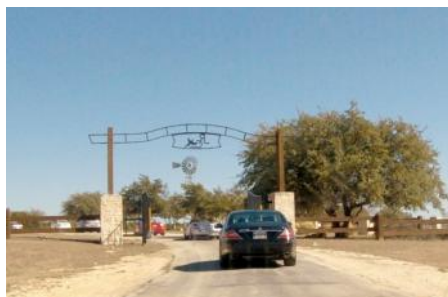
At the ranch gate with its famous brand.