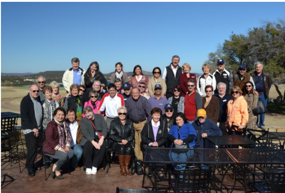
Part of the group in a Kodak Moment