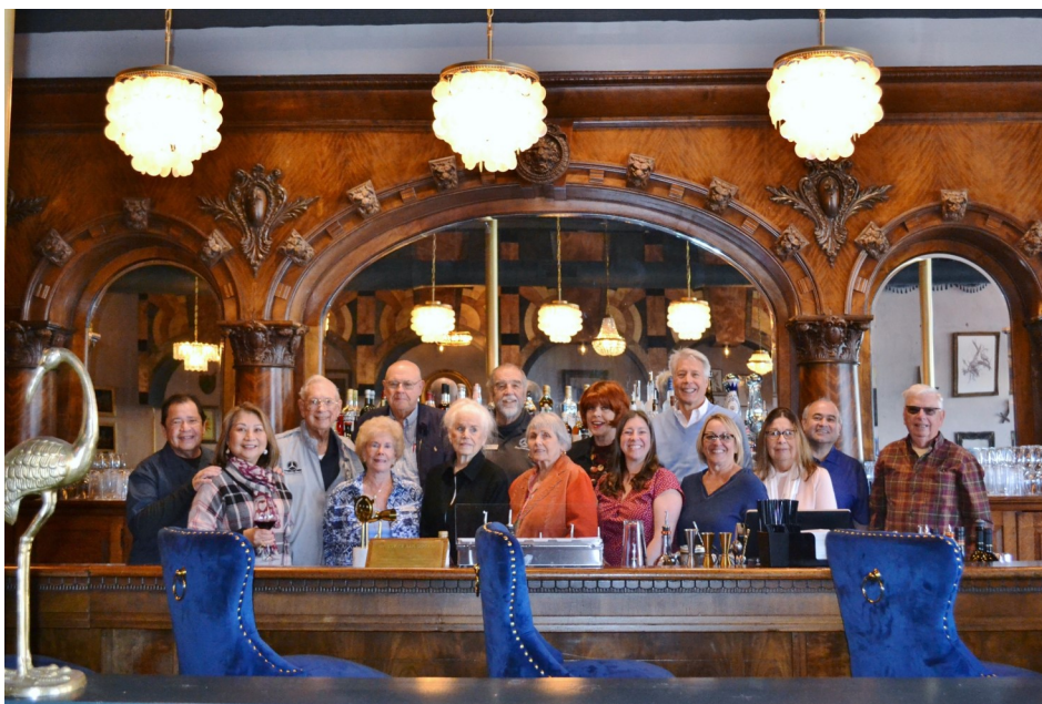
The massive Brunswick bar, originally from Dodge City, KS.

After lunch we walked or drove to the nearby Wiseman House chocolate store for some Valentine chocolate shopping.