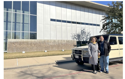
The Modern's contemporary façade and sign.