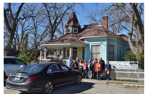
Wiseman House chocolate store.