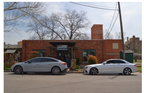
At the Crazy Water Company.