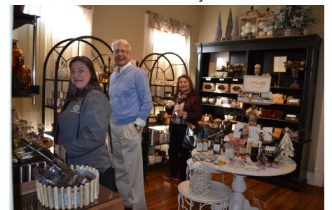
Shopping for treats.