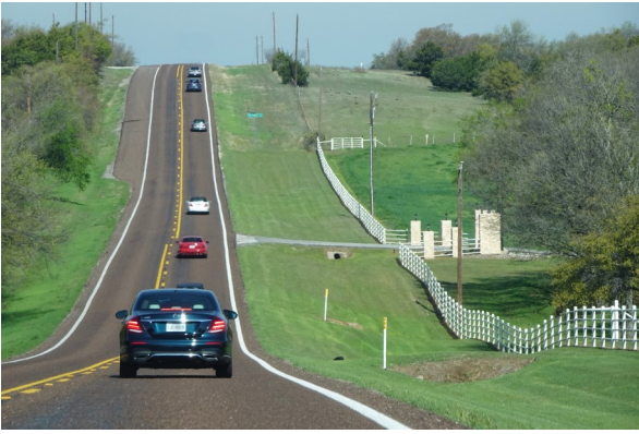
En route to Graford.

Twenty-seven folks in 13 cars enjoyed a home cooking lunch at The Café in Graford, a vintage Mustang collection at the Blue Oval Car Barn in Mineral Wells, and the Famous Water Company store, home of Mineral Wells' Crazy Water.