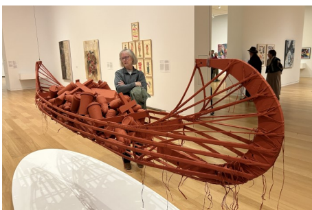
The canoe is used extensively in Smith's works