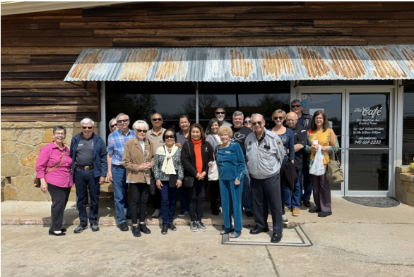
At The Café in Graford.

The Famous Water Company is a remnant of Mineral Wells' golden age as one of the world's foremost spa cities. Its Crazy Water is so named because it is rumored to prevent, ease or solve mental issues. After a dose of Crazy Water No. 4 (their strongest mineral water), we emerged from the event in the best possible state of mental health.