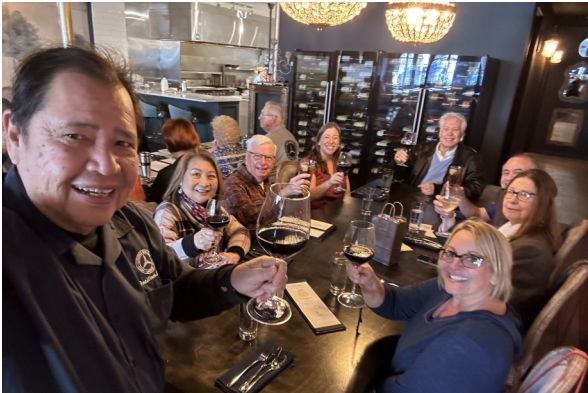
Sitting down to lunch.