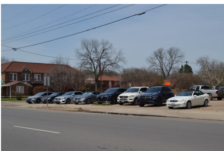
Part of the lineup at Mineral Wells.