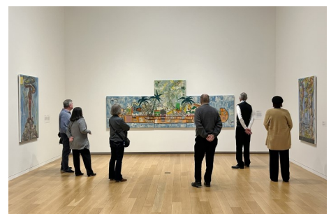
The canoe is again the subject here.