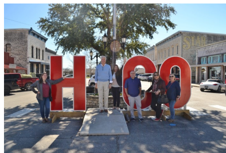
The sign was missing the "I". No more.