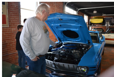
Going over the engine bay of a Boss.