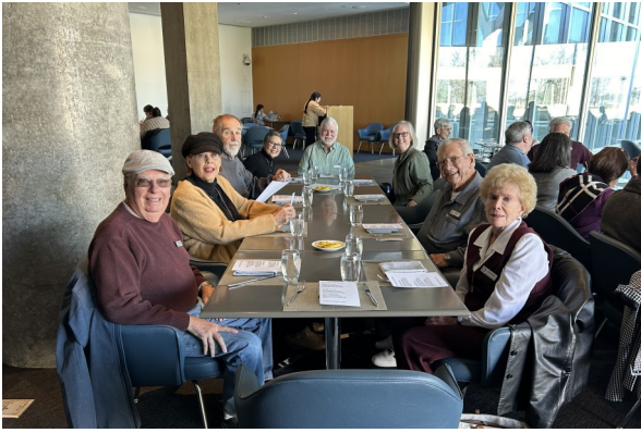
At the Café Modern.

Twenty-two folks attended our first event of the year, which was a guided tour and lunch at the beautiful Modern Art Museum of Fort Worth. The Modern features one of the foremost collections of modern and contemporary art dating from the postwar period to the present. Its collection is housed in an elegant contemporary building designed by the renowned Japanese architect Tadao Ando.