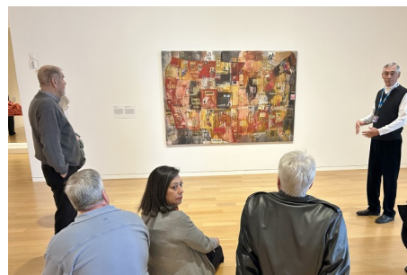
Our guide explains each major piece.