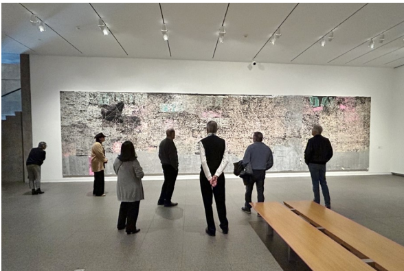
The art compliments the Modern's spacious minimalist interior.

We began our visit with prix fixe lunch at the excellent Café Modern, which is managed by Wolfgang Puck. After lunch, we split into 2 groups expecting to see the museum's permanent exhibit. Instead, our docent guided us on a tour of Native-American Jaune Quick-to-See Smith's works, and talked about some of her most intriguing pieces. This, the museum's current featured exhibit, is a fusion of contemporary art and Smith's view of life in America as seen through her cultural perspective. This was a pleasant surprise, because the permanent exhibit will always be there to see another time.