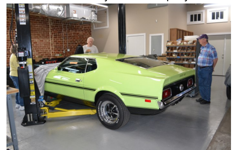
Freshly-restored Boss 351.