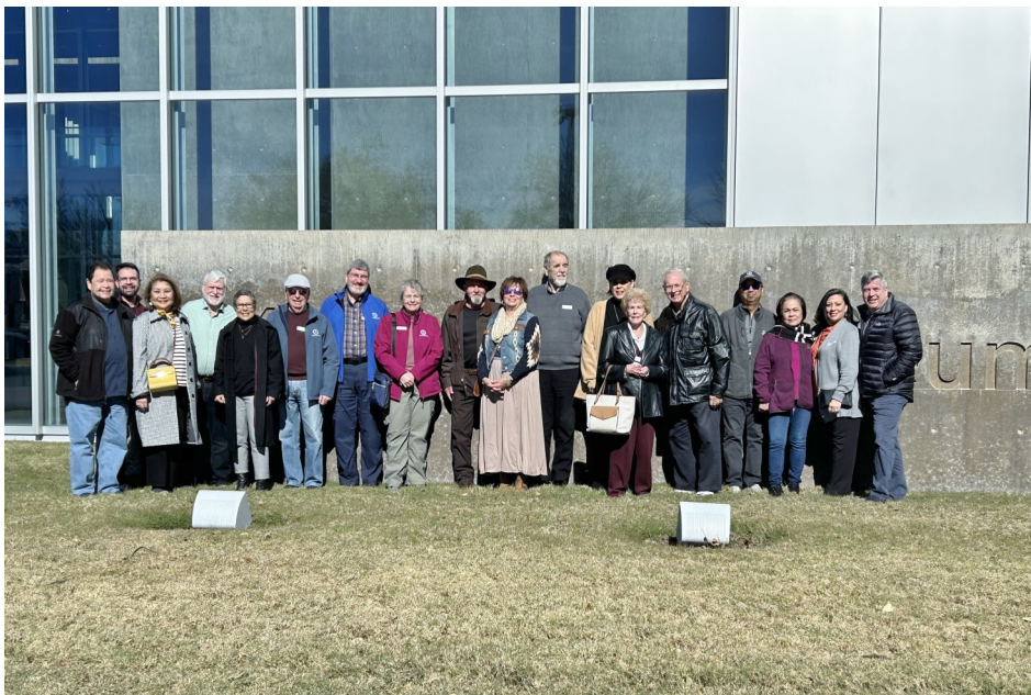
All here. Almost.

It was time to hurry home right after the tour, because the dreaded arctic blast was fast approaching Fort Worth from the Northwest.